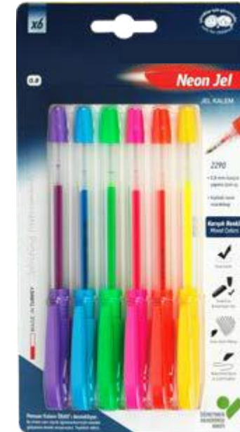
2290 NEON GEL PEN