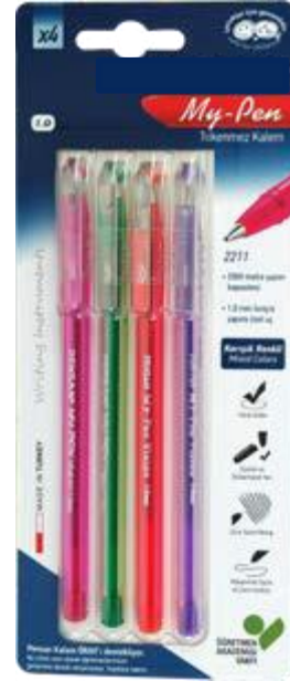
2211 MY PEN BALL POINTPEN