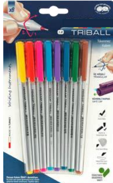
1003 TRIBALL BALL POINTPEN