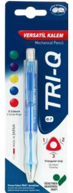
21140 TRI-Q MECHANICAL PENCIL