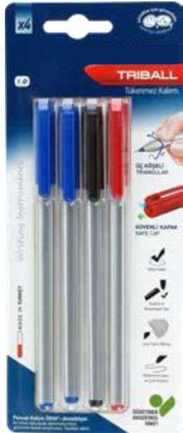
1003 TRIBALL BALL POINTPEN