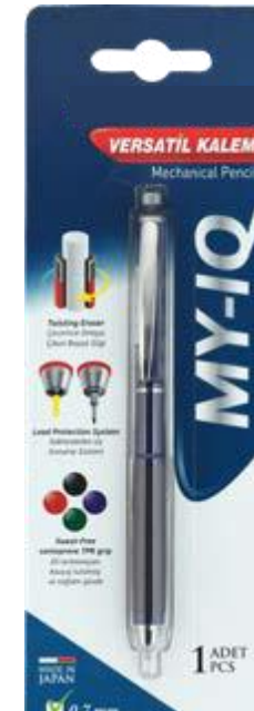
21116 MY-IQ MECHANICAL PENCIL