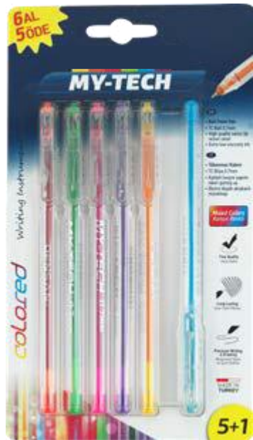
2240 MY TECH BALL POINTPEN