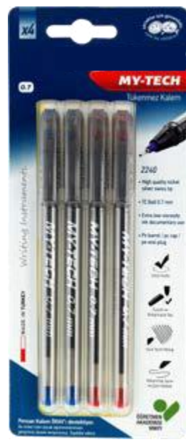
2240 MY TECH BALL POINTPEN