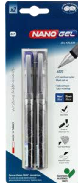
6020 NANO GEL PEN