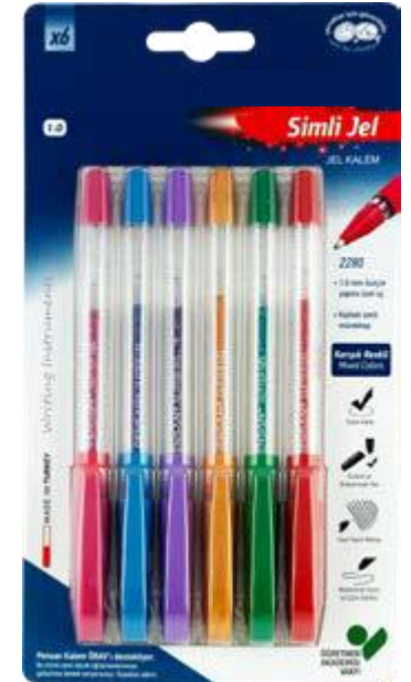
2280 GLITTER GEL PEN